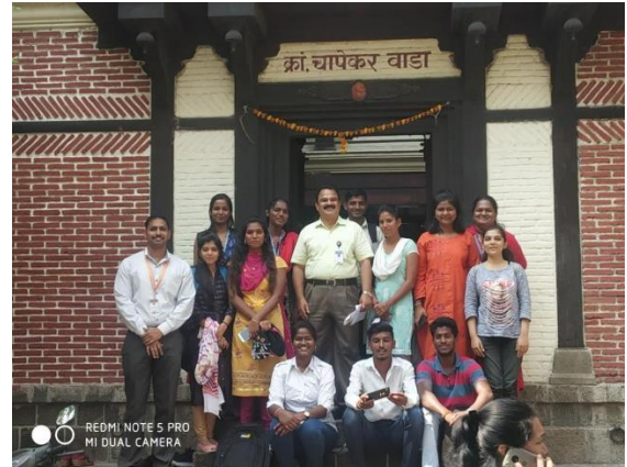
VISIT TO CHAPHEKAR WADA