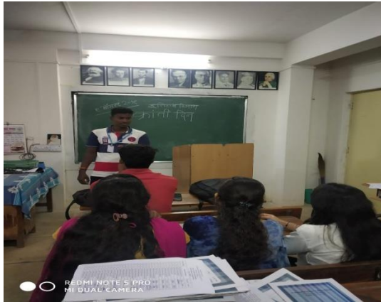
KRANTI DIN CELEBRATION