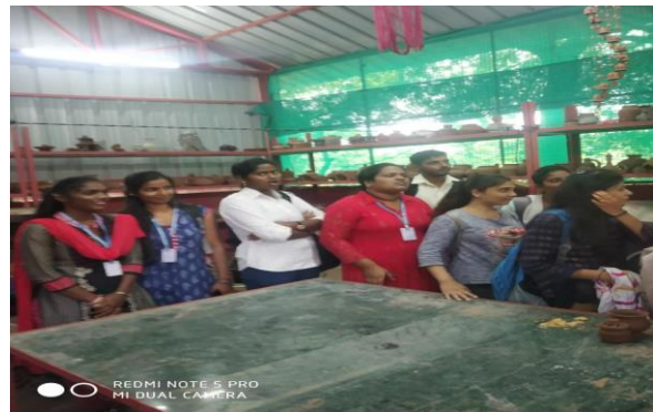
VISIT TO NGO