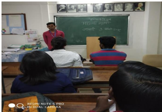
CELEBRATION MAHATMA GANDHI BIRTH ANNIVERSARY